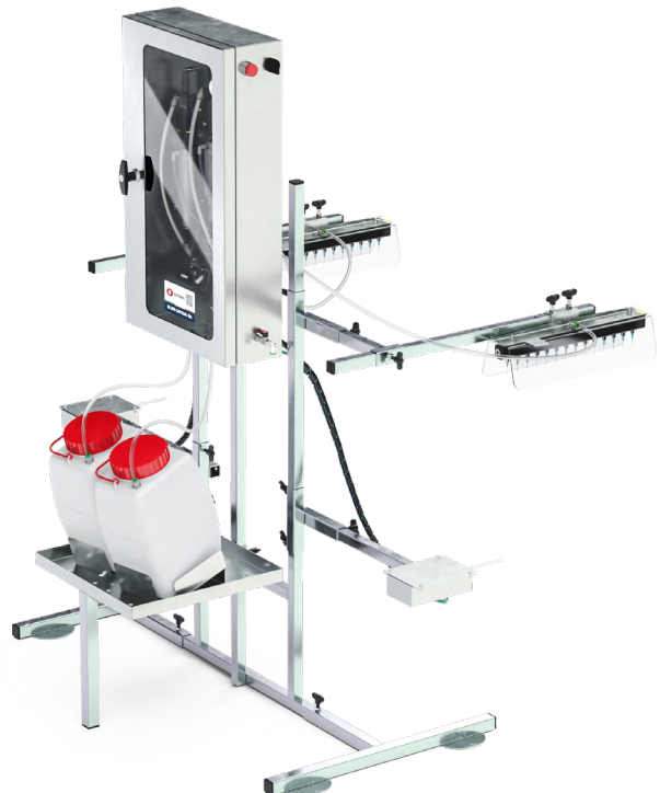
Double gel version