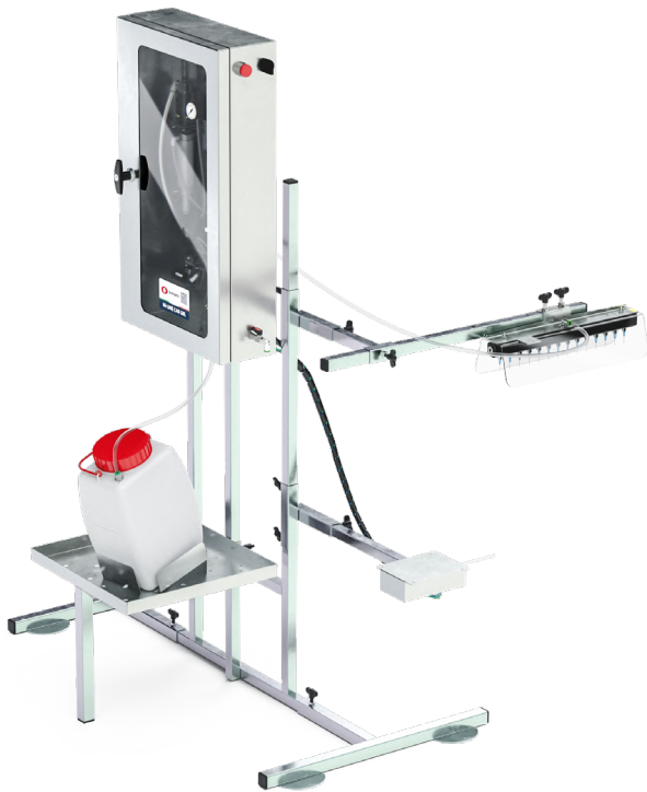
Single gel version